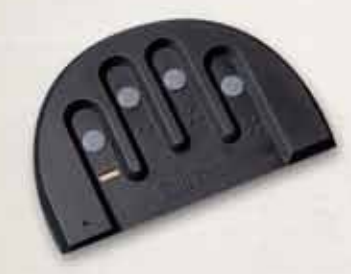
Specifications on page 11