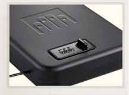
Specifications on page 11

Three-number Combination Lock (NanoVault 300)